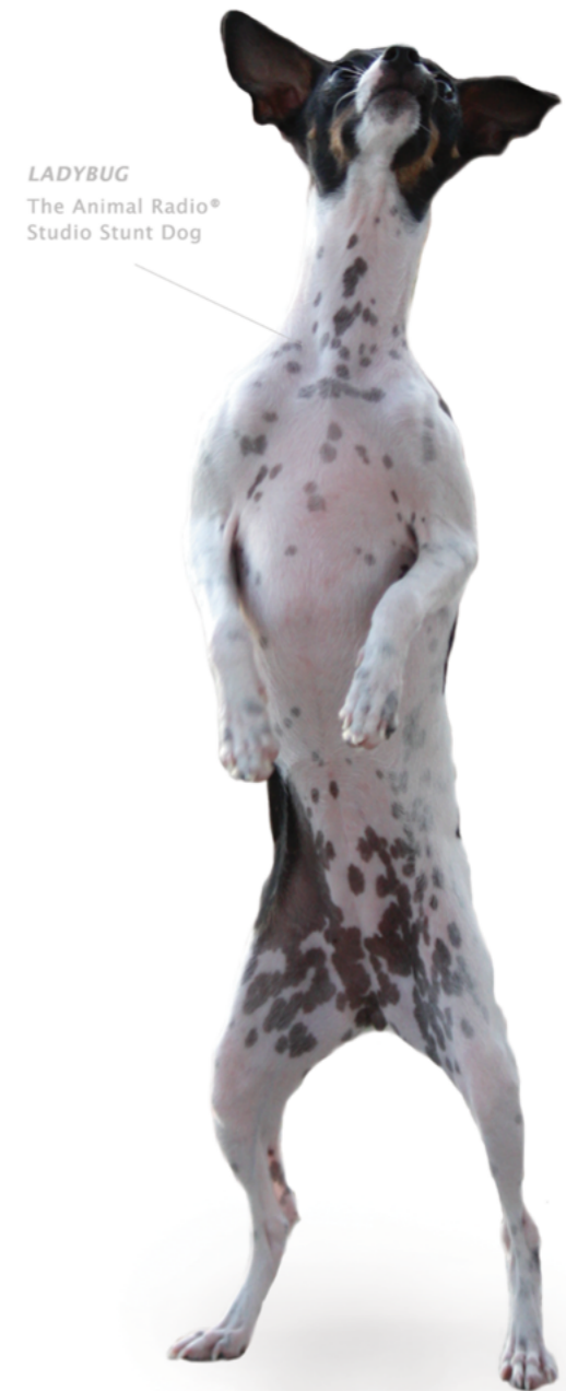
LADYBUG The Animal Radio® Studio Stunt Dog

Animal Radio® Reaching over 350,000 animal lovers every week.